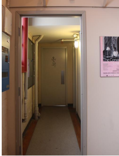
This is the Hallway to the washrooms.

When facing the box office if you turn to the left there is a hallway to the washrooms.