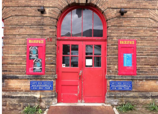
Here we are at the main entrance to the Theatre.

Theatre Passe Muraille is a building that creates and hosts shows and events featuring Theatre, Music and Dance.