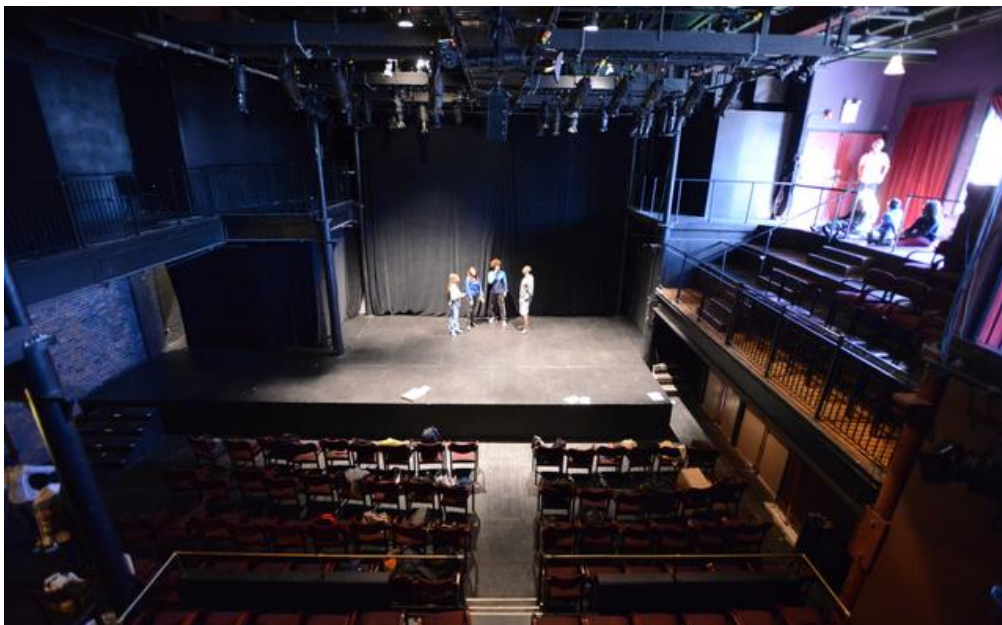
This is the Mainspace Theatre (this picture is taken from the 2 nd floor).